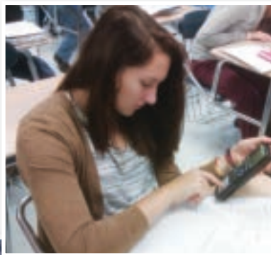
Math students enjoying graphing calculators.