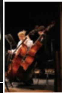
String ensemble bass players.