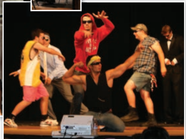
Top: Hairspray February 2011 Above: Shakespeare in H'Wood Right: Mr. EOS