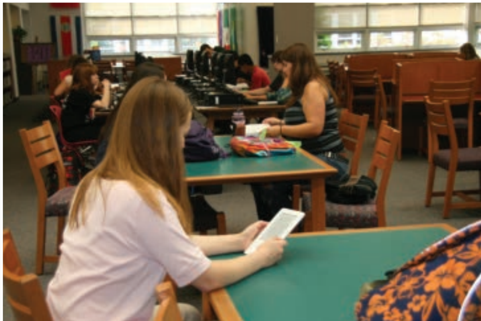
Kindle in the LMC.