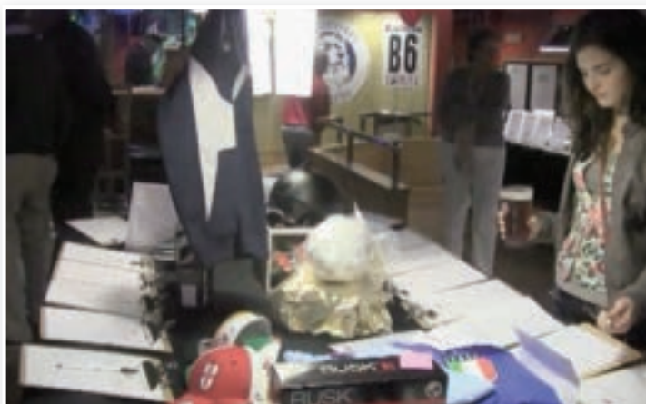
Observer at auction.